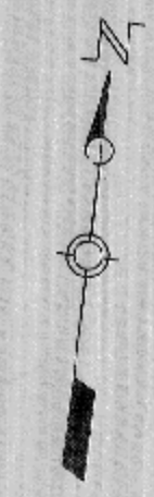
LOCATION PLAN SCALE: 1" = 50'