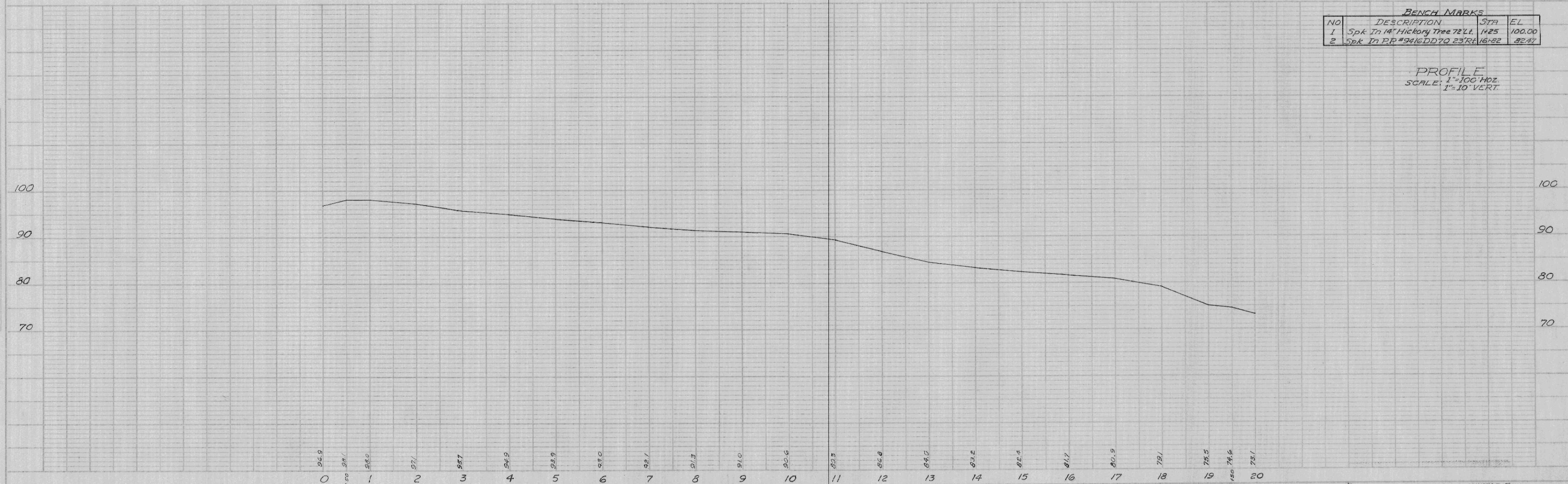
PROFILE SCALE: 1"=100' HORIZ. 1"=10' VERT.