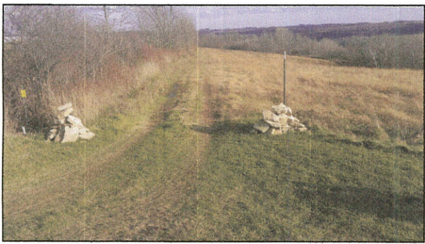
7.02' N 69°25'43" W Photo taken at point "A" facing East

Bearing Basis: The La Crosse County Coordinate System. Referenced to the (WCCS) NAD 83 (2011) Adjustment.